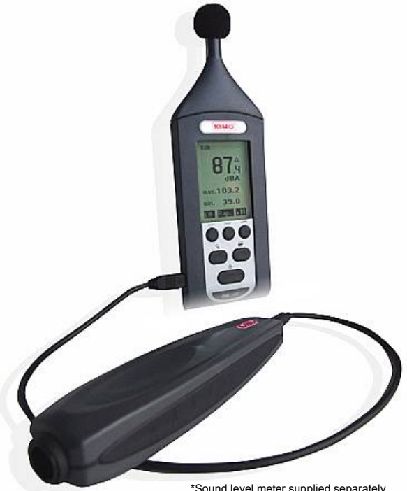
*Sound level meter supplied separately