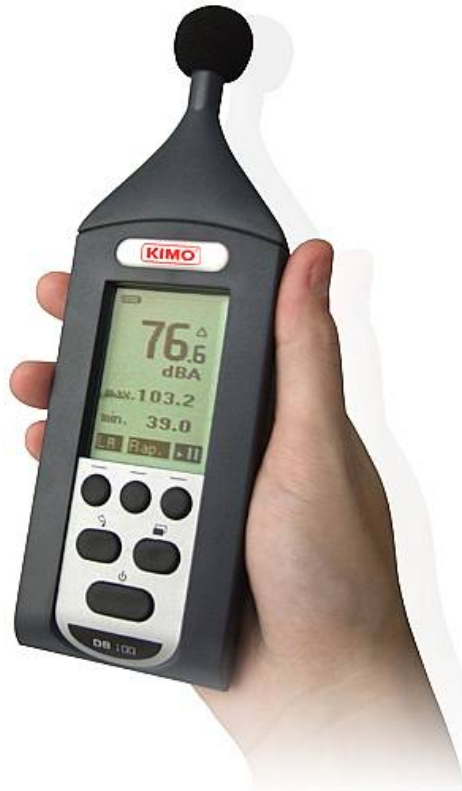
*Livré avec écran anti-vent