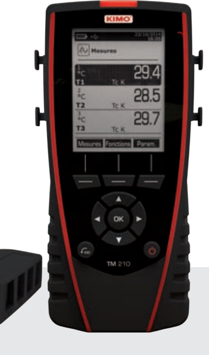
Thermocouple module 4 channels