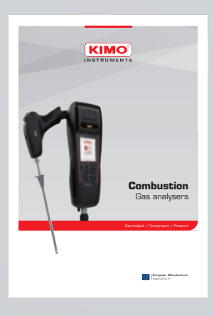
Flue gas analysers