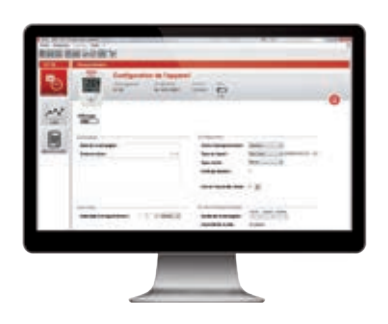
Kilog software (option) and Kilog lite software (free)