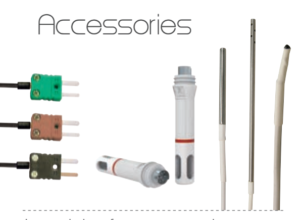
Large choice of temperature and hygrometry probes