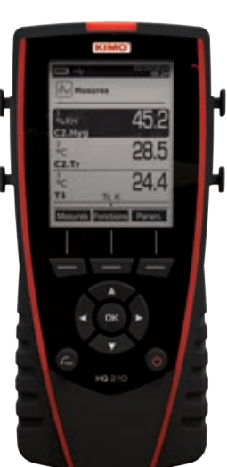
Class 210 multi-probes